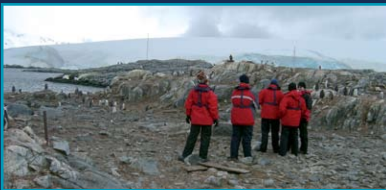
Closed area begins at the line of concrete blocks on the NW end