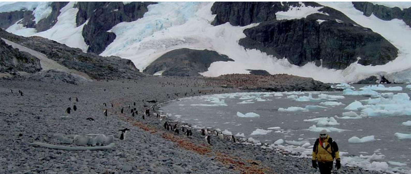
Cuverville Island landing beach

In the late season (moult time), the density of penguins will probably confine visits to the immediate vicinity of the landing beach.